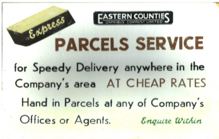
Advert 1. This little gem was rescued from the Wellington Road Travel Office at Great Yarmouth Bus Station in the late 1970s. It measures 10 inches x 7 inches and is mounted in a glass frame bound with black tape. The style of the company logo indicates that it dates from before the last war.

Direct delivery could only be effected within an area not exceeding one mile from agent's premises. All parcels were accepted for despatch subject to the conditions of carriage which were exhibited at the company's enquiry offices and principal agents.